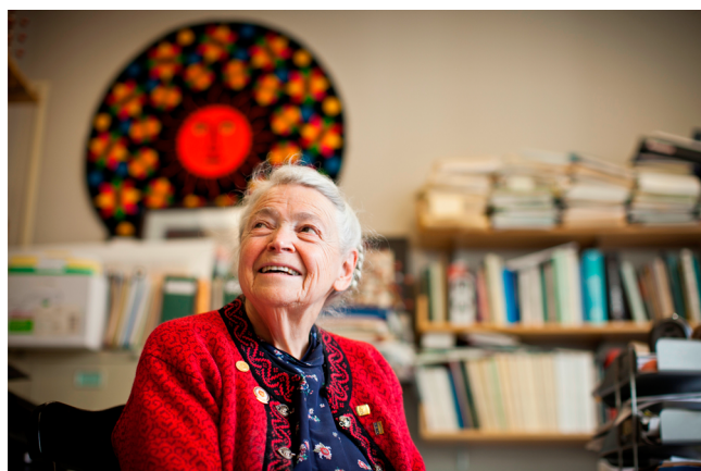
The image has not been modified.

One cannot forget meeting Mildred S. Dresselhaus, Institute Professor Emerita of Physics and Electrical Engineering and Computer Science at MIT, and long-standing pioneer in the area of carbon materials, thermoelectrics, solid state science, and a host of other research efforts to be found in her 1700 published papers. This powerhouse of energy,